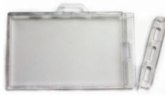
permanent-lock cardholder - holds up to 2 cards, end piece locks cards inside

Also available with a key-lock option, the end piece locks cards inside. Purchase un-locking key separately.