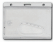
enclosed clear rigid with thumb-slot on reverse